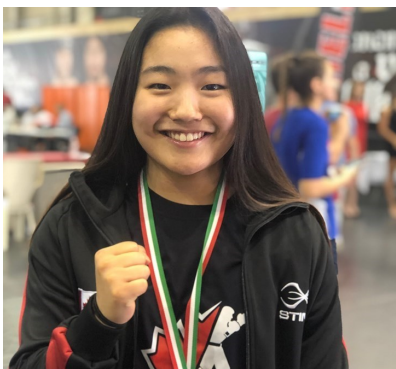
Kate Lee Presidents Award – Female Prix du Président – féminin